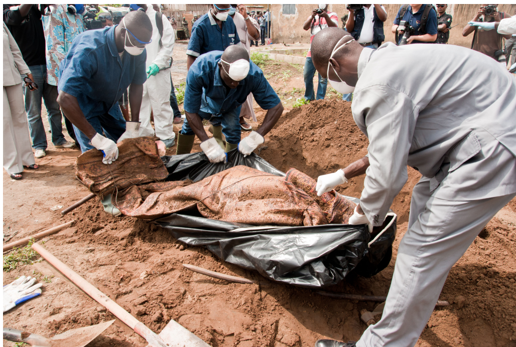
IVORY COAST MASS GRAVE

build an active roster of almost 450 experts from 89 countries speaking tive missions to bring mass criminals to justice.