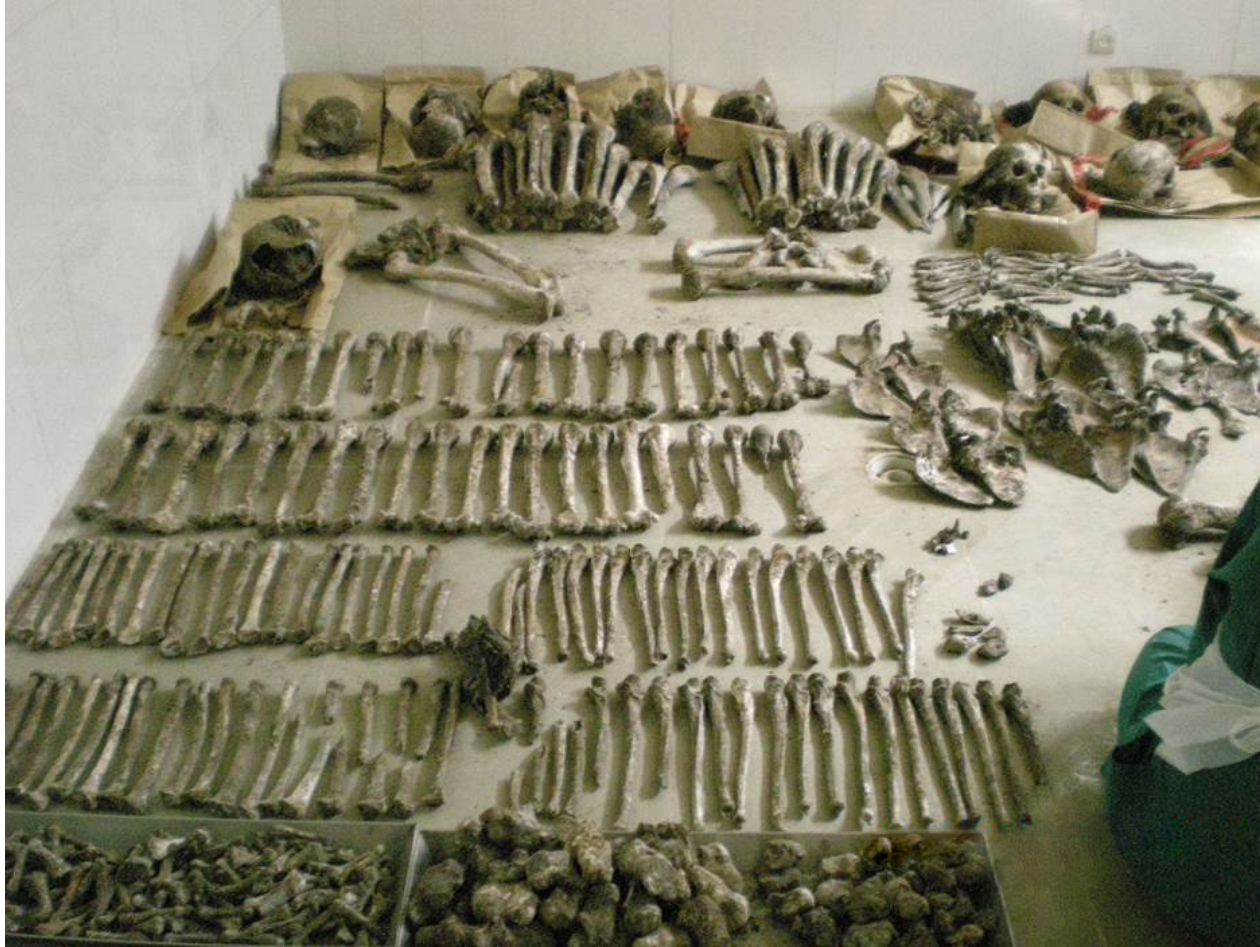
Bones - Mali

specialized and specifically trained criminal justice professionals for . Operational since only 2009, JRR already has 76 participating states,